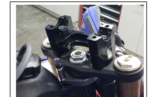
Re-install the triple clamp with the new Sub mount attached to it now.