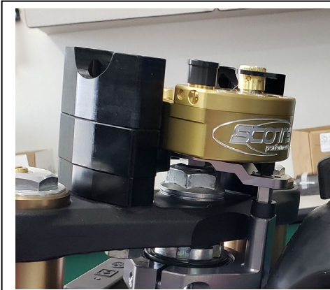
Install the Stabilizer so the tower pin is flush with the top of the link arm.