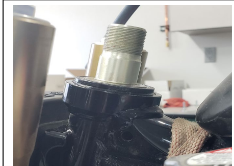
Remove the castle nut and dust cover