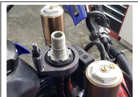
Install the frame bracket securely and centered around the head tube.