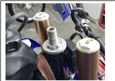
Use a tie down to secure the forks

1. Step by step instructions. Be sure to read the text that accompanies these photos there is a specific order.