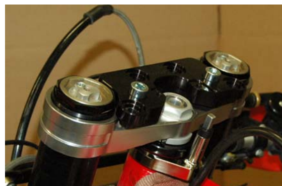
Install the base plate portion of the Rubber Sub Mount to the rear holes on the stock triple clamps