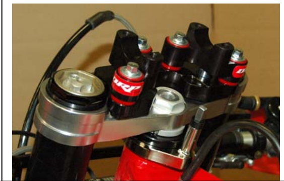
Using the additional instruction sheet, assemble the parts of the Rubber sub mount as shown