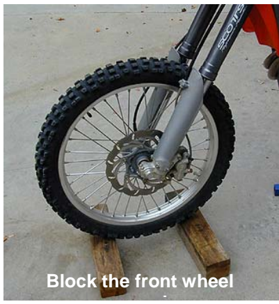
Block the front wheel