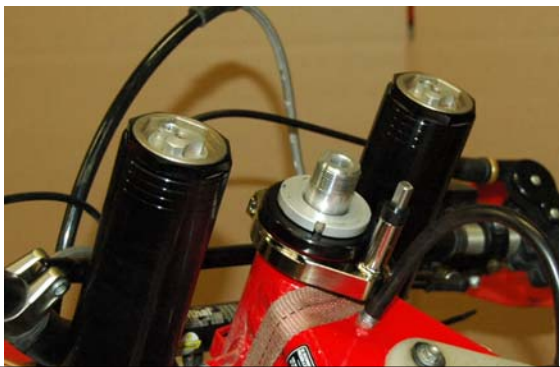
Install the new bearing shroud and jam nut, tension the jam nut properly so the bearing turns freely