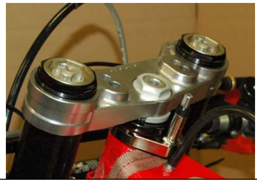
Install the triple clamp and tighten the main nut to the factory specifications