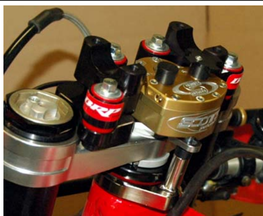
After making sure the tower pin does not hit the bottom of the stabilizer body, install the stabilizer to the sub mount using the bolts provided.