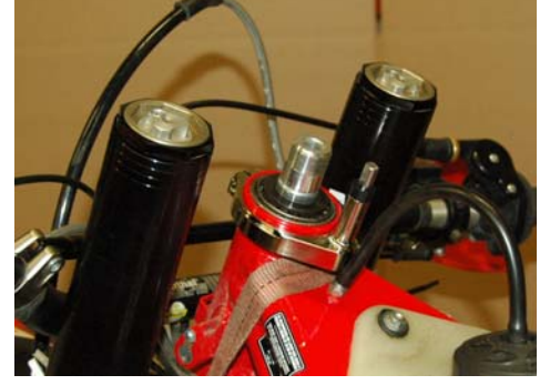
Remove the jam nut and seal cover. Then install the frame bracket