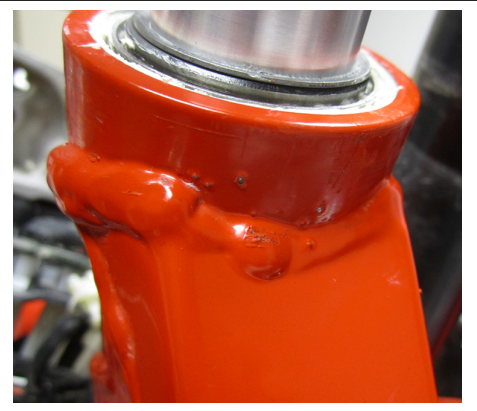
File welds keeping the frame bracket from clamping tightly around head tube