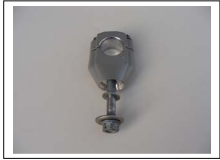
Remove the stock lower bar mounts