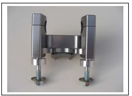
Sub mount/bushings/nuts & washers Installs as shown above