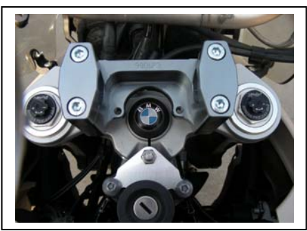
Sub mount installed correctly