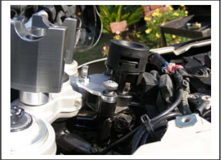
Side view of Sub & Frame bracket Spacers go under sub mount