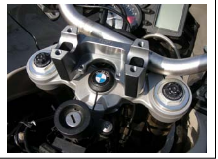
Lay bars forward out of the way & install Sub mount as shown