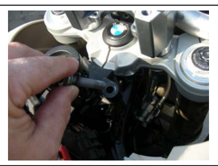
Stock key switch bolts are Torx remove and install frame bracket