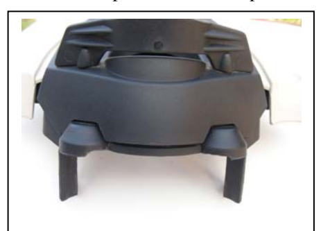
Trim here until this fits properly