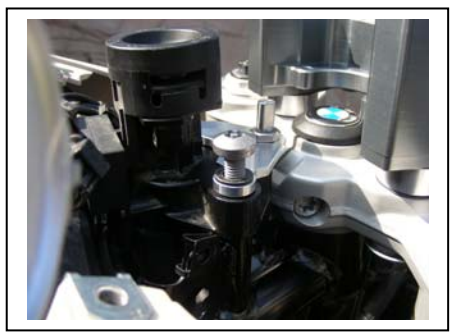
Frame bracket mounts as shown under the stock key mount bolts