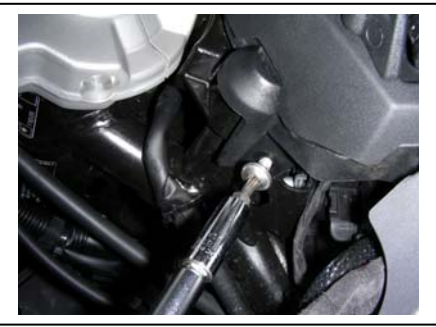
Remove the plastic torx key bolts