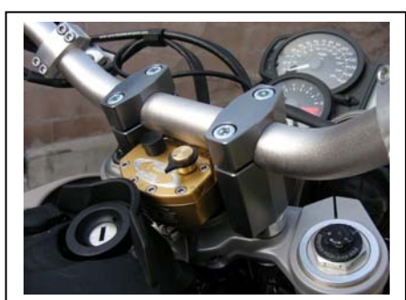
Finished kit 3/9/2011 BMW 6504-28