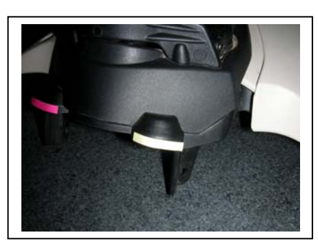
Tape marks where trimming occurs