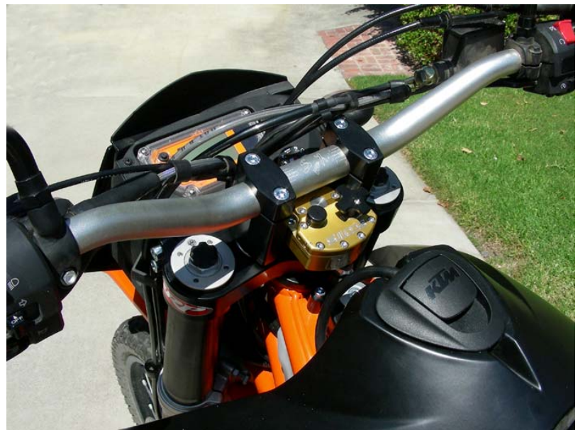
The large knob pictured in this photo is an optional part.