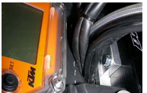
Cables routed properly, no binding