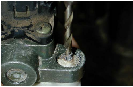
Drill a hole dead center for an easy out or..