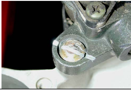
Or Cut a slot in the head for screwdriver