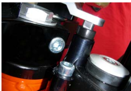
Frame bracket installed-note tower pin height