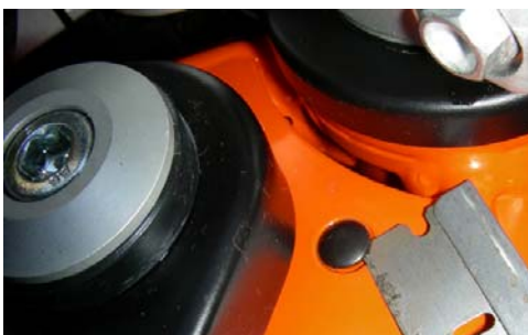
Frame bracket hole, remove plastic covers