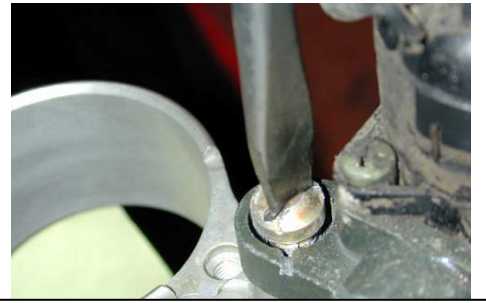
Hand impact driver or good slot head